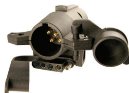
#8000 3-Way Trailer Adapter