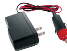
#CHR001 500mA Battery Charger