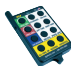
#MUT-RM12-4A 12-Button Remote