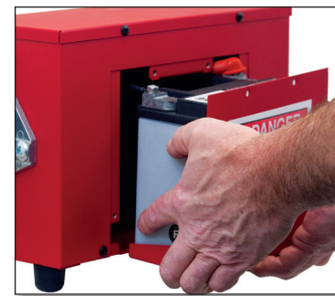
Optional battery not included