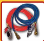
AIR BRAKE HOSES