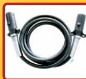
5 FT. 7-WAY ROUND PIN CABLE